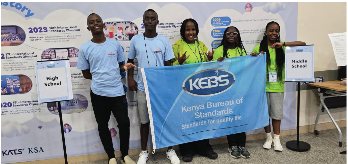
Students from Thika High School and Moi Girls High School, Nairobi who represented Kenya during the 17th International Standards Olympiad held in Korea between the 23rd to 25th August, 2024 posing with the Kenya Bureau of Standards flag while in Korea. KEBS sponsored them.

She expressed KEBS' commitment to transforming Kenya into a global leader in standards solutions, and said capturing young minds in the quest to entrench quality as a way of life was a giant step in asserting Kenya's leadership in standards.