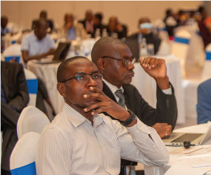
A section of metrologists from across Africa who attended the 17th AFRIMETS General Assembly in Nairobi