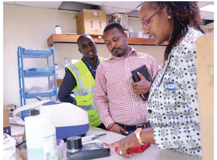
The Managing Director's tour was meant to assess KEBS' operations in inspection of incoming goods.