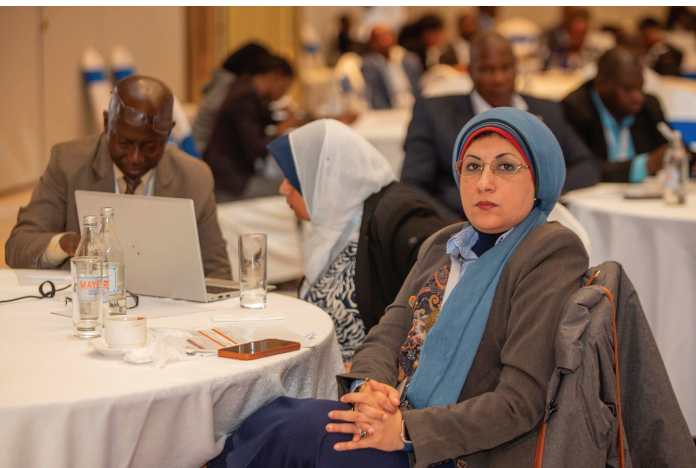
A participant keenly following the proceedings at the 17th AFRIMETS General Assembly in Nairobi