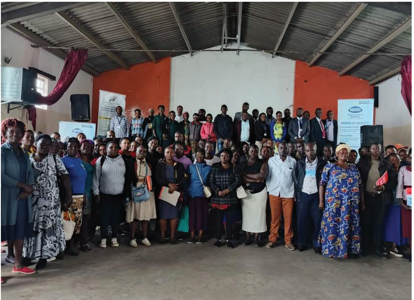
Participants at the Textile stakeholders' forum in Kariobangi, Nairobi pose for a group photo at the end of the event.

"By engaging with stakeholders across various sectors, KEBS ensures that policies and standards are robust, relevant, and supportive of industry growth. Together with industry stakeholders, KEBS is dedicated to shaping a textile sector that is innovative, sustainable, and globally competitive. This cooperative approach guarantees that our initiatives and standards are well-grounded in the current needs and future aspirations of the industry, paving the way for a thriving textile market in Kenya and beyond," the Managing Director said.