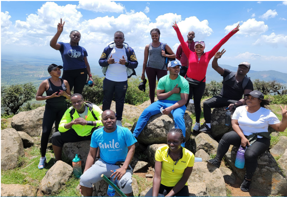
The Kenya Bureau of Standards (KEBS) gym group take a moment for a group photo after a grueling hike of the Ngong Hills on February 3rd this year. The hike was the group's inaugural outdoor activity with plans to follow it up with a hike at the Karura Forest.

T he Kenya Bureau of Standards (KEBS) Gym Group enjoyed a memorable fitness experience with an inaugural hike at the Ngong Hills on February 3, 2024.