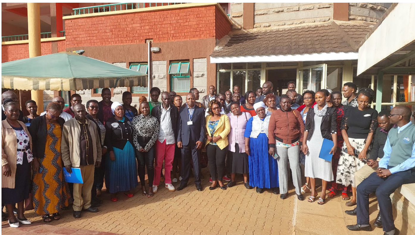
Participants who attended a workshop for textile stakeholders in the North Rift organized by KEBS in Kitale posing for a group photo.