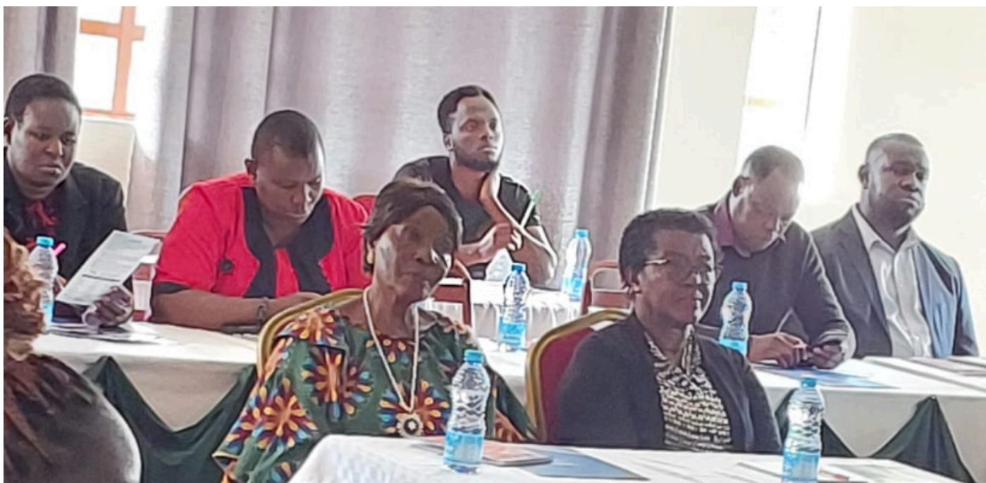
Some of the textile industry players in the North Rift following the proceedings at a textile stakeholders workshop organized by KEBS in Kitale.

Participants requested KEBS to consider extending the validity of the S-Mark permits from the current 2 years to 5 years.