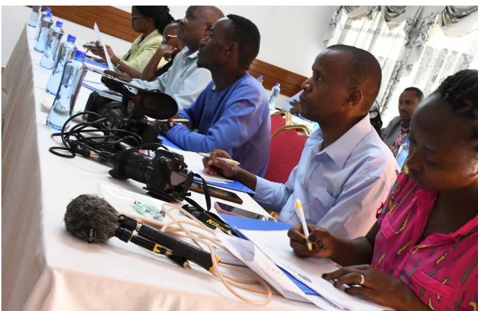
Embu journalists attentively following the proceedings when KEBS hosted them for a sensitization workshop on February 7th 2024.