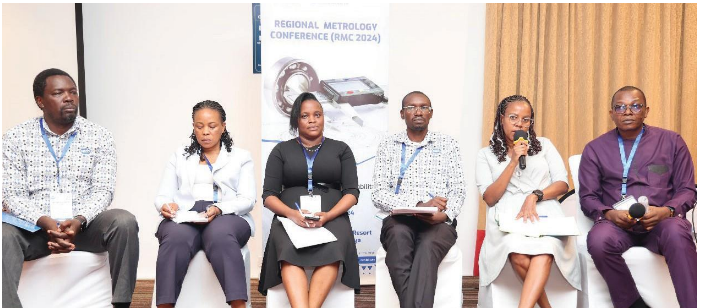
A panel discussion as the Regional Metrology Conference got underway in Mombasa between the 15th to 17th July, 2024.