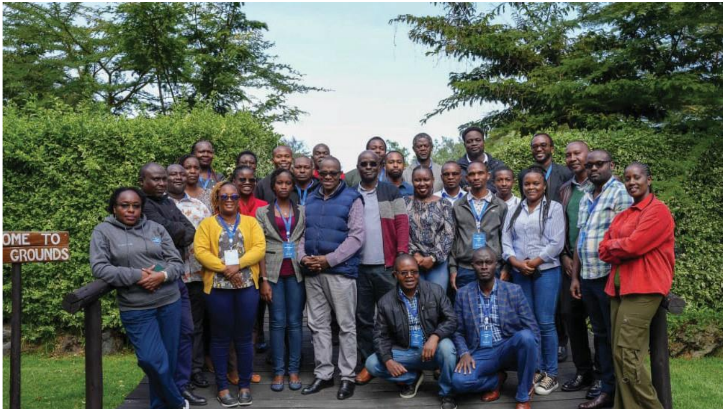
Participants pose for a group photo at the conclusion of the Energy Management Workshop in Naivasha on June 26th, 2024.