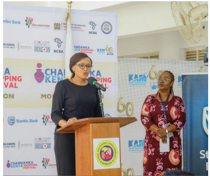
One of the presenters during the Changamka Shopping Festival