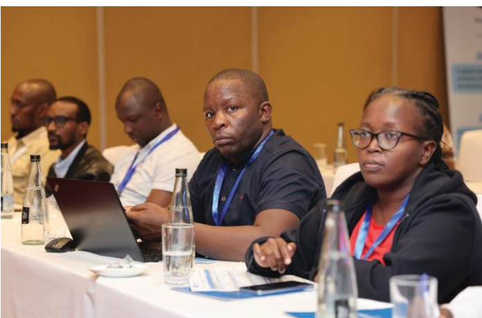
Some of the participants drawn from 15 countries in Africa and beyond attended the Regional Metrology Conference held at the coastal city of Mombasa between the 15th to 17th July, 2024