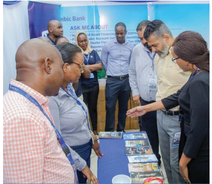
Governor, Abdulsamad Shariff, visits some of the stalls at the Changamka Shopping Festival in Mombasa