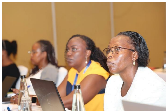
Participants follow proceedings during the 3-day Regional Metrology Conference held in Mombasa between the 15th to 17th July, 2024 and hosted by the Kenya Bureau of Standards.