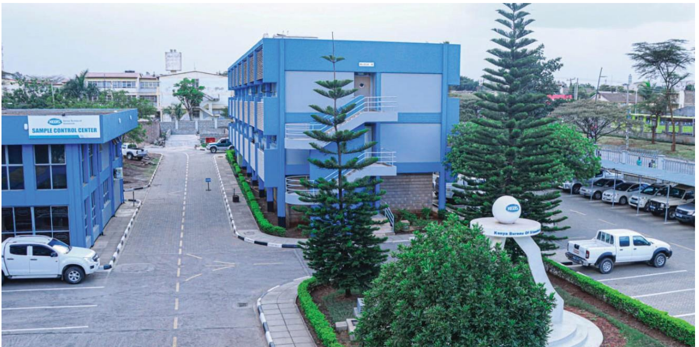
The main administrative block at the Kenya Bureau of Standards Headquarters in Nairobi

J uly 2024 marks the Golden Jubilee for the Kenya Bureau of Standards (KEBS) and with it an important milestone for the country's quality and standardization aspirations.