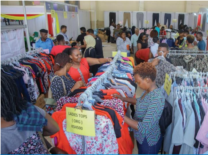
Shoppers exploring locally made products during the 4th Edition of the Changamka Shopping Festival at the Oshwal Centre, Mombasa on 4th July, 2024