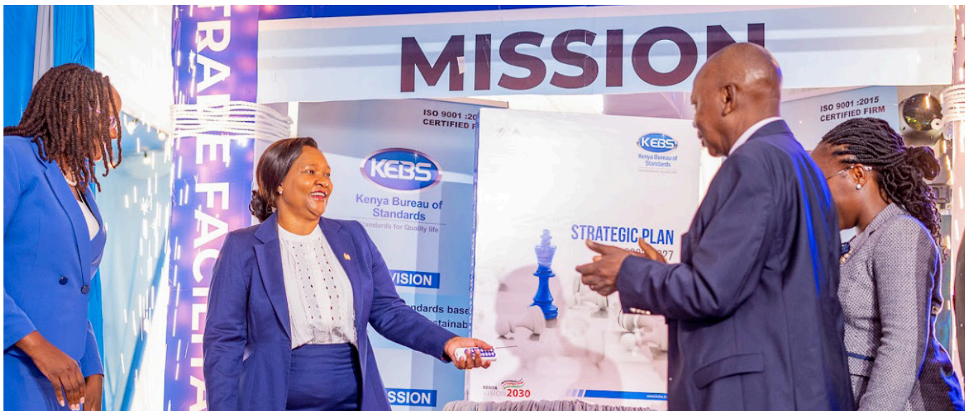
Investments, Trade and Industry Cabinet Secretary Rebecca Miano while officially launching the Kenya Bureau of Standards Strategic Plan 2023-2027 at the KEBS Headquarters