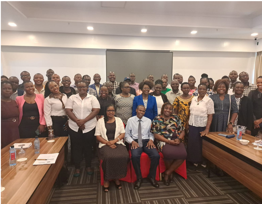
Participants at a stakeholder engagement in Kisumu to discuss the draft national quality policy