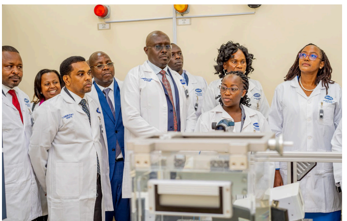
National Standards Council and Kenya Bureau of Standards top management viewing the Cobalt 60 facility when it was launched