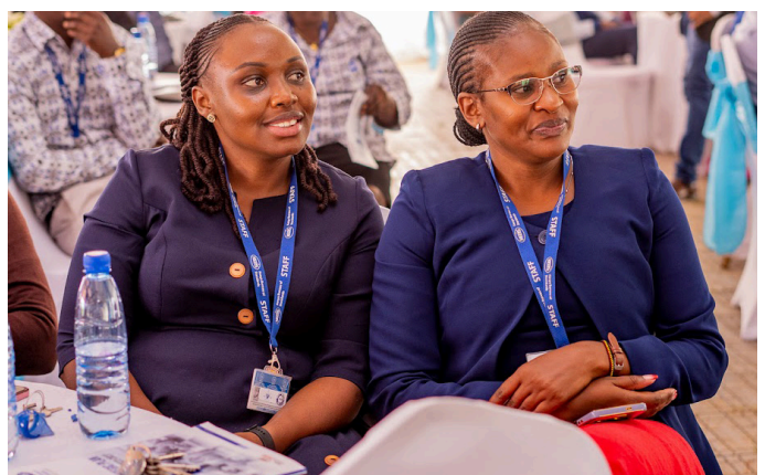
Kenya Bureau of Standards staff members following the proceedings during the launch of the KEBS Strategic Plan 2023-2027.