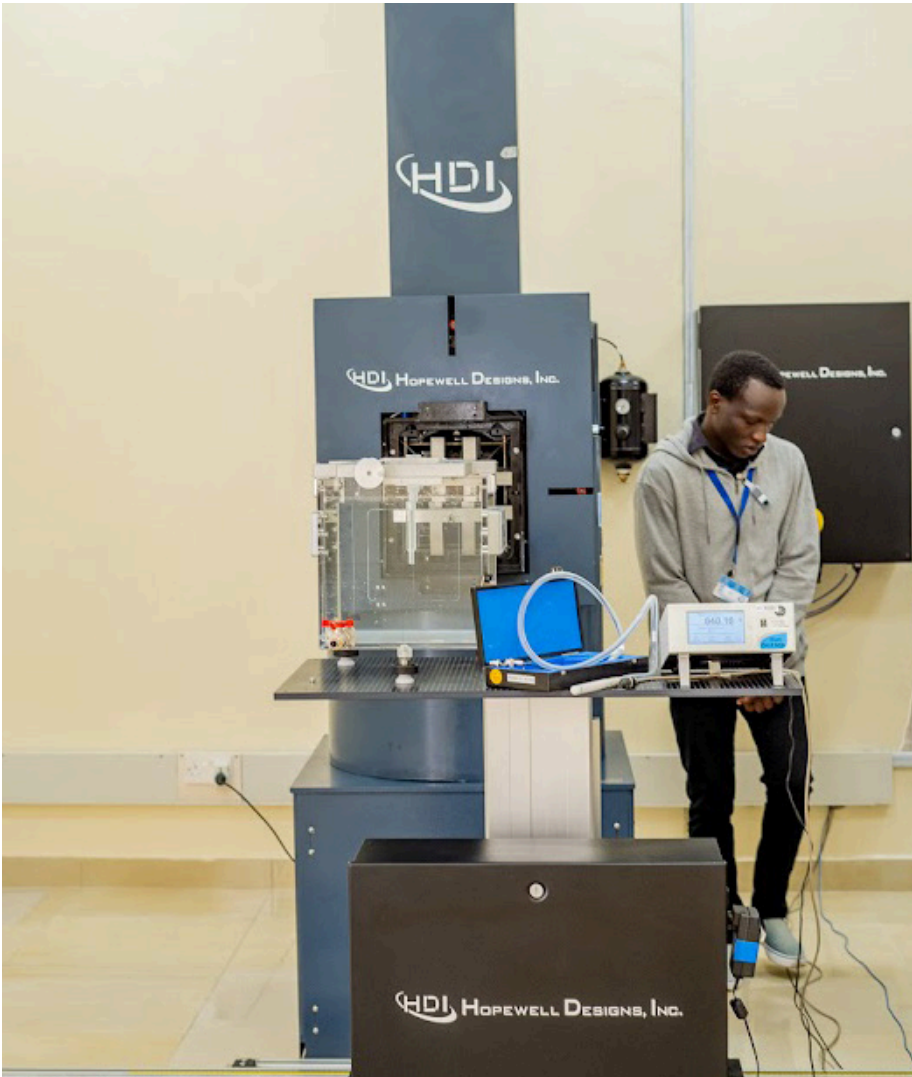
The Cobalt 60 radiotherapy calibration system which will be used to calibrate cancer treatment equipment.

The CS thanked the International Atomic Energy Agency (IAEA) for collaborating with the KEBS to acquire the facility.