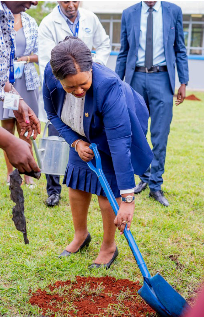
Cabinet Secretary Rebecca Miano plants a commemorative tree at the Kenya Bureau of Standards when she visited to launch the Cobalt 60 facility as well as the KEBS 2023-2027 Strategic Plan.