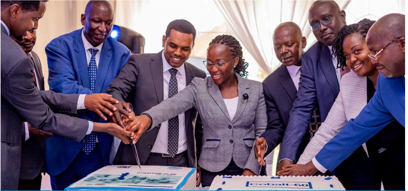
Cakes galore: National Standards Council and Kenya Bureau of Standards top management preparing to cut two cakes to commemorate the launch of the KEBS Strategic Plan 2023-2027 and the Cobalt 60.