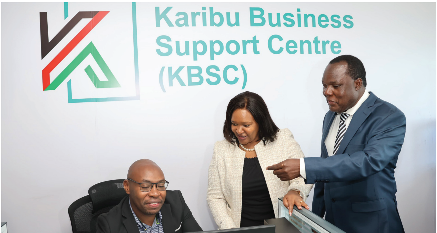
The Cabinet Secretary in the Ministry of Investments, Trade and Industry, Rebecca Miano, presides over the launch of the Karibu Business Support Centre in Nairobi.

T he recently launched Karibu Business Support Centre (KBSC) will have some of its countrywide offices housed within the Kenya Bureau of Standards (KEBS) regional network.