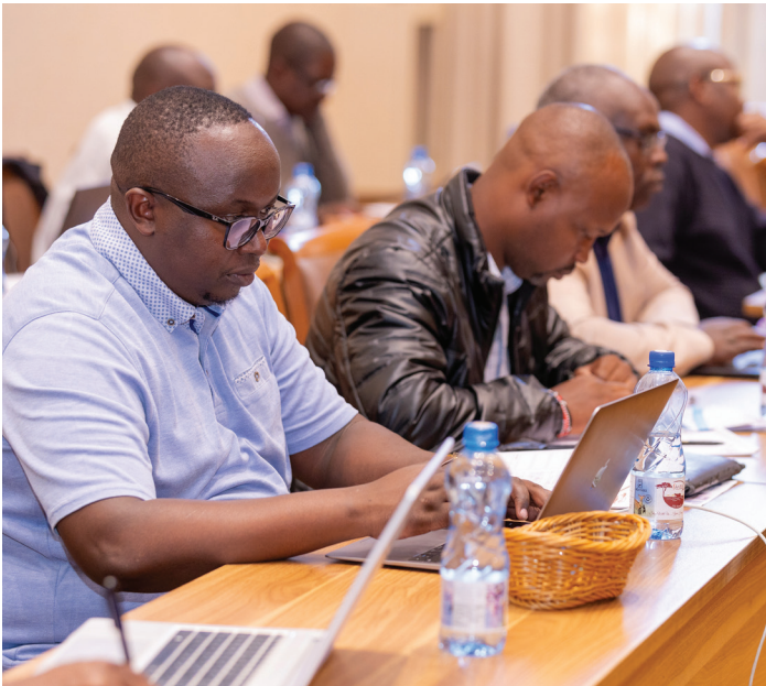
Some of the editors following the proceedings at the workshop. At least 30 senior editors attended the workshop.