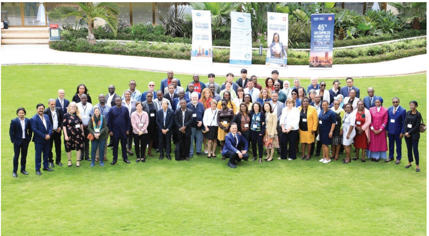
Delegates attending the ISO/COPOLCO 45th Plenary in a group photo at the end of the 3-day event in Nairobi.