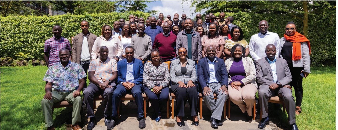
KEBS senior management and Editors pose for a group photo towards the end of the workshop.